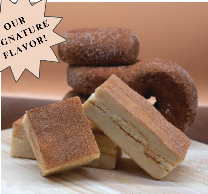
Apple Cider Donut